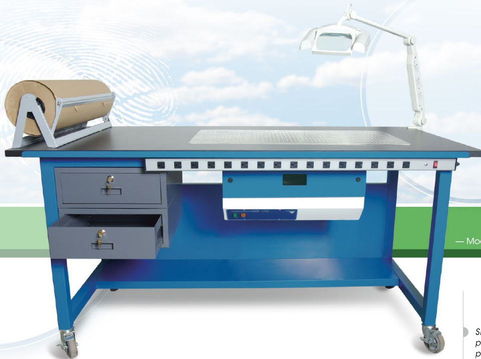
— Model EVB-72

Shown with optional airflow pod, magnifying lamp and power package outlet strip.